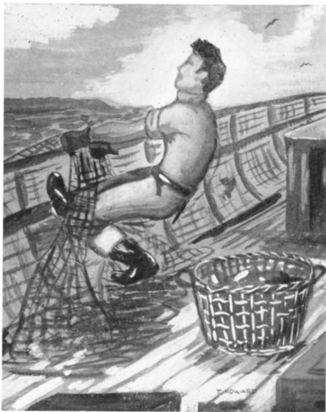
THE LONG HAUL