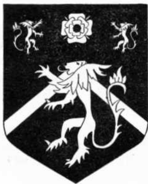
WILLIAM DE ALBENI COAT-OF-ARMS, WYMONDHAM ABBEY