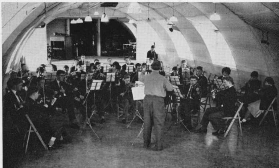
THE ORCHESTRA REHEARSING

A further aspect calls for notice; some fluctuation of membership is unavoidable in so impermanent a group as a school, and it is vital that a succession of aspirants shall be forthcoming to take up instruments laid down by those leaving the College. Too many young people have abandoned their attempts to learn a new instrument without having persevered sufficiently—without a whole-hearted