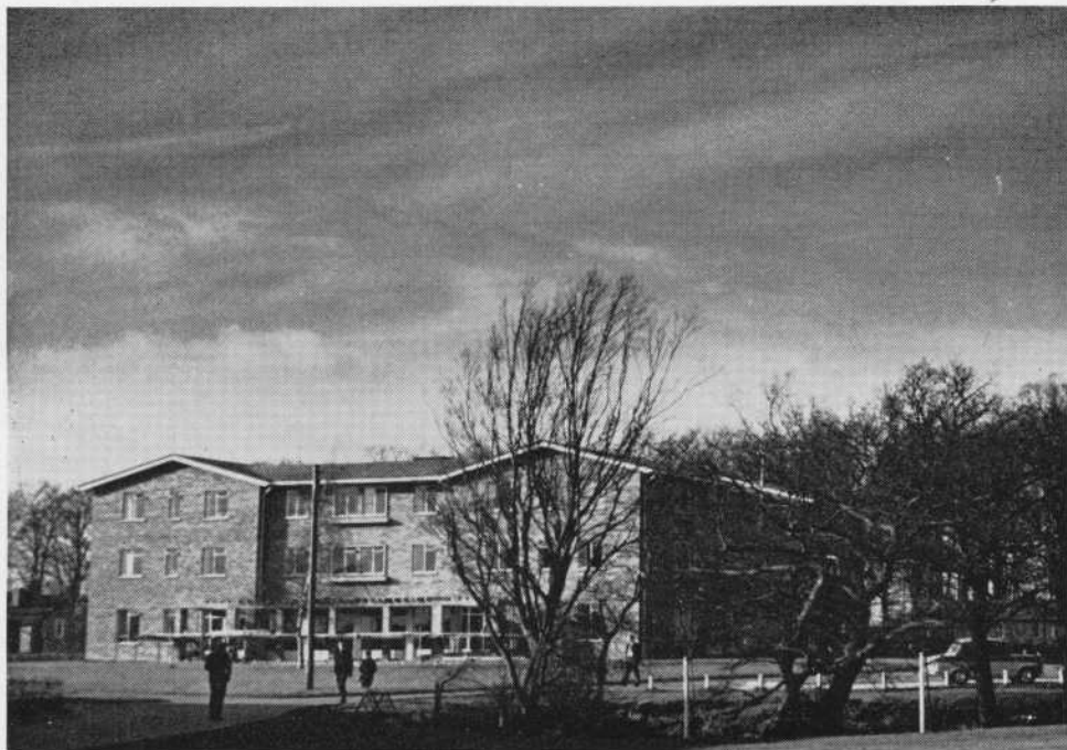
TREES, POND, LINCOLN HALL, WITH DINING ROOM EXTENSION BEING BUILT