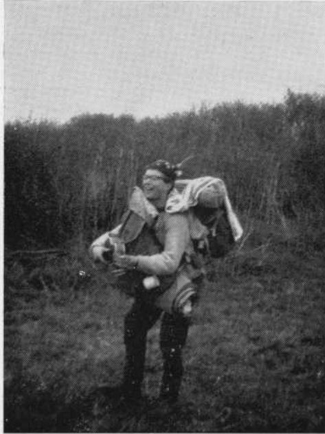
"SETTING OUT OVERLOADED"

The contemporary work gave us much material for discussion on the way home, and we are still debating the merits of much of it. We all agreed that it was a worthwhile trip.