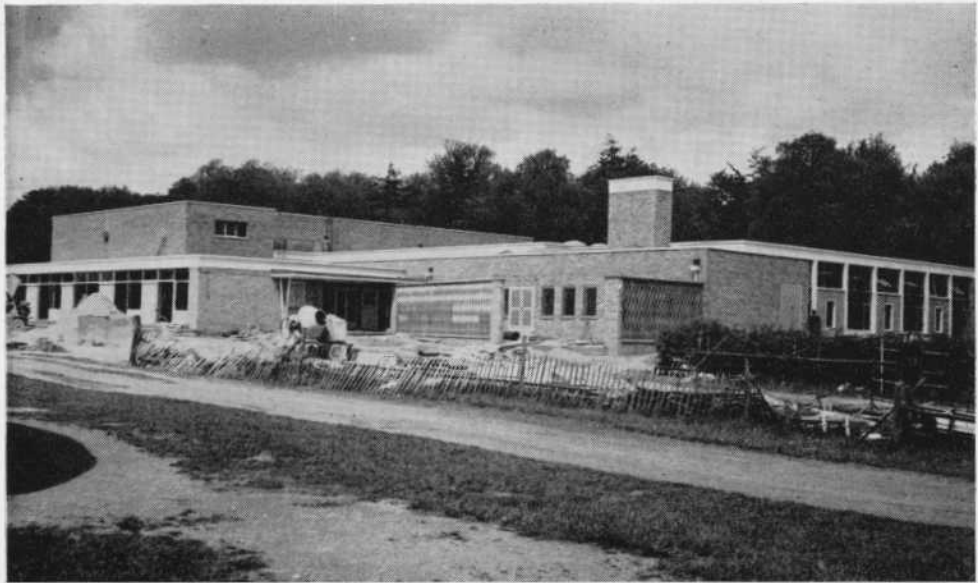
THE RECREATION AND GYMNASIUM BLOCK IN THE COURSE OF CONSTRUCTION