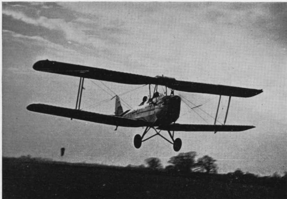
" I SET COURSE FOR NORTHAMPTON "

wind, and a visibility of about 40 miles. I sat back in the cockpit with a feeling of contentment, as I watched the land below slip away. Looking at my watch I decided that in five minutes Northampton would be in sight. One hour later I was frantically looking for somewhere to land, and I remember thinking, "Can't be lost—impossible! Is that Northampton below, or is it Manchester—or Leicester—or Birmingham?" But it was Northampton, and saying a few silent prayers, I brought the worn-out Tiger Moth in to land.