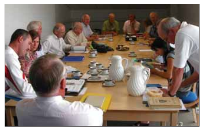
Your Old Wymondhamians Committee-Hard at work!

As keen students of Wymondham College site history will be aware, it was used for emergency teacher training in the period immediately following World War Two. Between May 1947 and December 1950 around 1500 future teachers were trained for the rigours of a life in education at the Wymondham Emergency Training College for Teachers. Those involved in this training formed the Old Wymondians Association to sustain old friendships, and held reunions at the college every year until 2005.