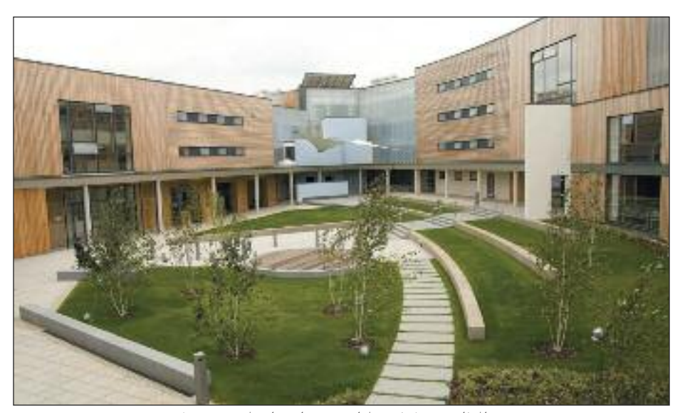
The award winning Enid Ralphs Building

Another important feature of the celebrations will be occasions when Old Wymondhamians here and around the world can meet and renew fellowship. I was most grateful for the warm welcome that my wife and I received at the Old Wymondhamians' Dinner in Melbourne, Australia, in October. The success of that event was proof, if any were needed, that time and distance do not weaken the ties that former students feel with the College and with each other.