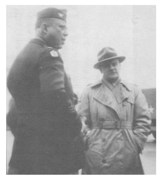
The Gable Gators

Three times a day on three days of the week, movies were shown, on other days feature films could be seen on the wards. Once a week there were G.I. movies and newsreels. There was a world premiere of the film 'Saratoga Trunk' with Ingrid Bergman, when a souvenir programme was produced.